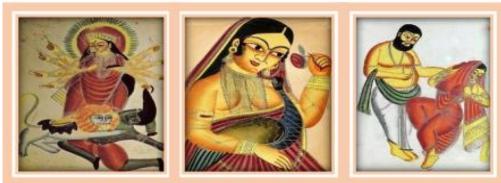
Fig. (4). The common theme of bengal pattachitra.

essentially on mythological storytelling. Despite this, in the post-colonial era, folk art forms like Pattachitra started depicting socio-political themes as the spirit of independent India, and the wish to associate themselves with contemporary global happenings arose. Fig. (7) by (Mondal and Bhattacharjee, 2024) covers the 9/11 attacks, and Fig. (9) by (Zanatta and Roy, 2021) portrays the COVID-19 pandemic situated well within this bracket as an expansion of thematic scope. Although Pattachitra draws its visual syntax and narrative structure from [original] Pattachitra, such as presented in Fig. (8) by (Chowdhury, 2022), it can be argued that these two figures prospect an idea about the evolution of Pattachitra art from a critical historical aspect to a political commentary.