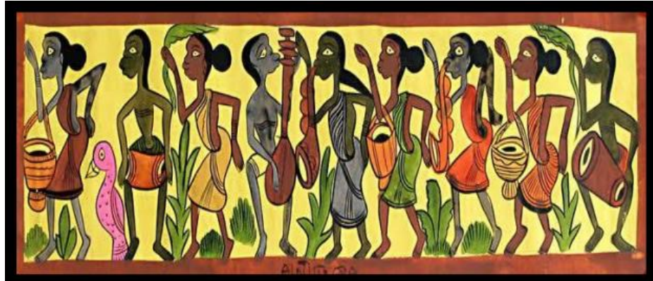
Fig. (6). Tribal Pattachitra Bengal.