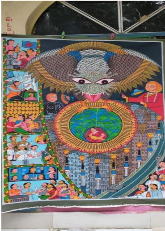
Fig. (10). Anwar Chitrakar, “Coronavirus”. ICCR award-winning scroll without Song acknowledgments to Anwar Chitrakar. Source: (Zanatta & Roy 2021; p151).

insurgency, which sowed hybridity. Later developing more overtly in the socio-political Pattachitras.