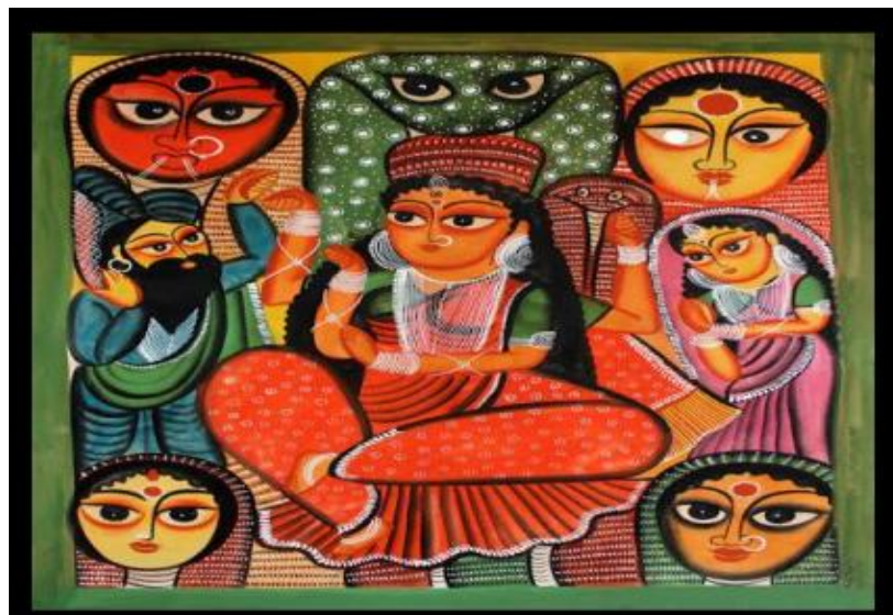
Fig. (5). Chouko pat on popular folklore of manasamongalkavya by Swarnachitrakar 2018.